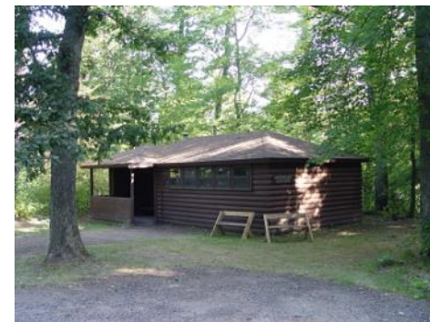
Ranger Mac Cabin